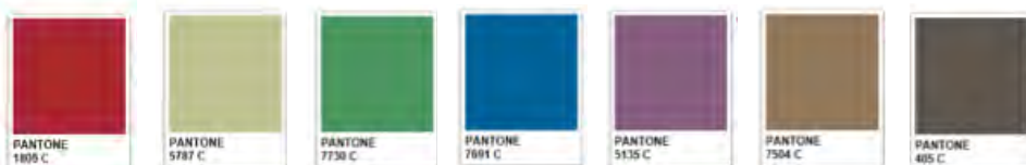
OUR MOST POPULAR SEVEN COLORS ARE IN-STOCK.